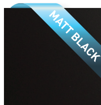
Tile Size: 330x330