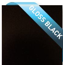
Tile Size: 200x200

Built to last No Limit Hearths have a selection of ceramic tiles with two edge finishing options.