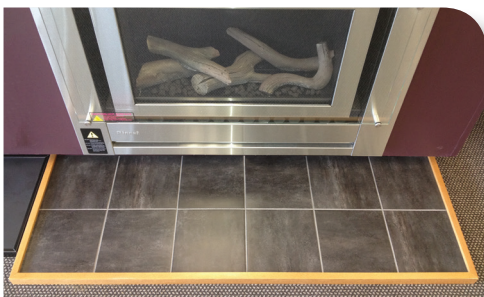
INSERT HEARTH basalto tile | rimu trim