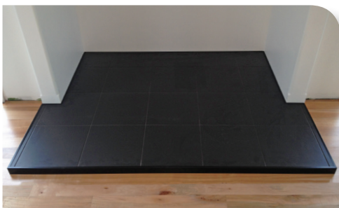
WALL HEARTH matt black tile | black trim