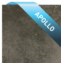
Tile Size: 307x307