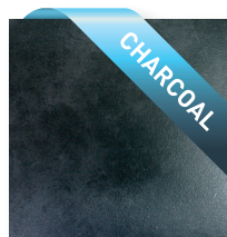
Tile Size: 200x200