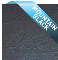
Tile Size: 300x300