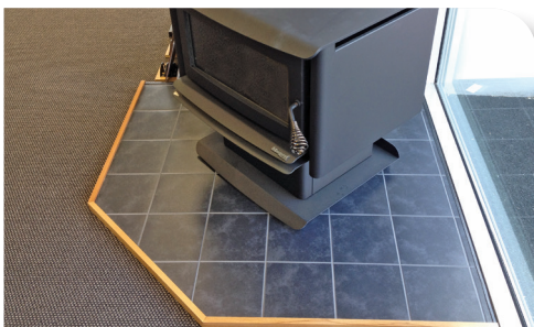
CORNER HEARTH charcoal tile | rimu trim