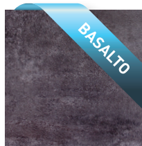
Tile Size: 200x200